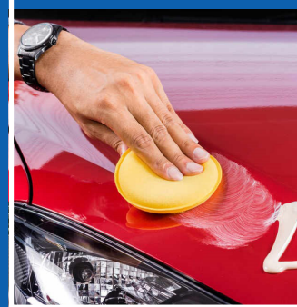
Exterior Wax Polishing